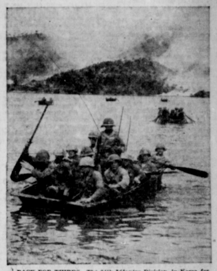
BACK FOR THIRDS—The 24th Infantry Division, in Korea for the third time, puts its soldiers through assault landing practice.

The course, conducted by the Texas Engineering Extension Service, featured the discussion of the most modern method of safety.