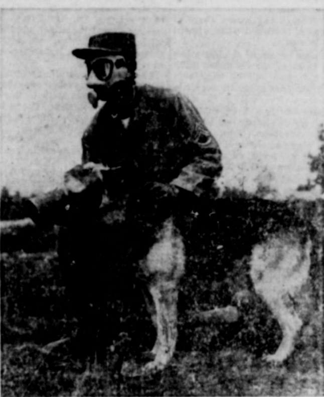
FITTING FOR MAN OR BEAST —The Army's highly-trained dogs are so important in combat that they have their own gas masks to be worn in event of enemy attack. Here a scout dog and his handler participate in a mock gas attack during maneuvers in Germany.