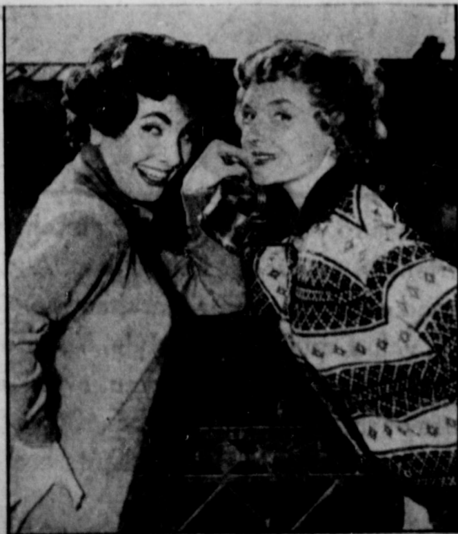
CORNY, BUT NICE —Synthetic material with corn fiber as its base is what these mademoiselles are modeling in Paris, France. The sprinkling can is to show you that the material is waterproof, and the manufacturer claims that garments fashioned from the new fiber are also warm as wool, soft as cashmere.

Prizes ranging from balls, bats, and gloves are to be awarded in each of the contests.