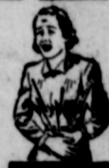
Lydia Pinkham's has a quieting effect on the uterine contractions (see chart) which may often cause menstrual pain!

Take Lydia Pinkham's! See if you don't get the same relief from cramps and weakness... feel better both before and during your period! Get either Lydia Pinkham's Compound, or see, improved Tablets, with added iron! Lydia Pinkham's is wonderful for "hot flashes" and other functional distress of the "change of life." Test!