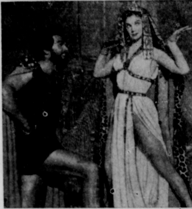
A scene from MGM's biggest musical filmed in Cinemascope and color. Starring Esther Williams, Howard Keel, and Marge and Gower Champion. Playing Wednesday and Thursday on your Ranger Drive-In Screen.