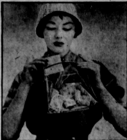
Matched accessories in chalk white insure that the young lady won't be shamed by her possessions as revealed by this clear lucite handbag.

You can start the collection yourself and let your friends and relatives add to it at Christmas time or for birthdays. Buy them as you would fashion accessories and use them proudly.