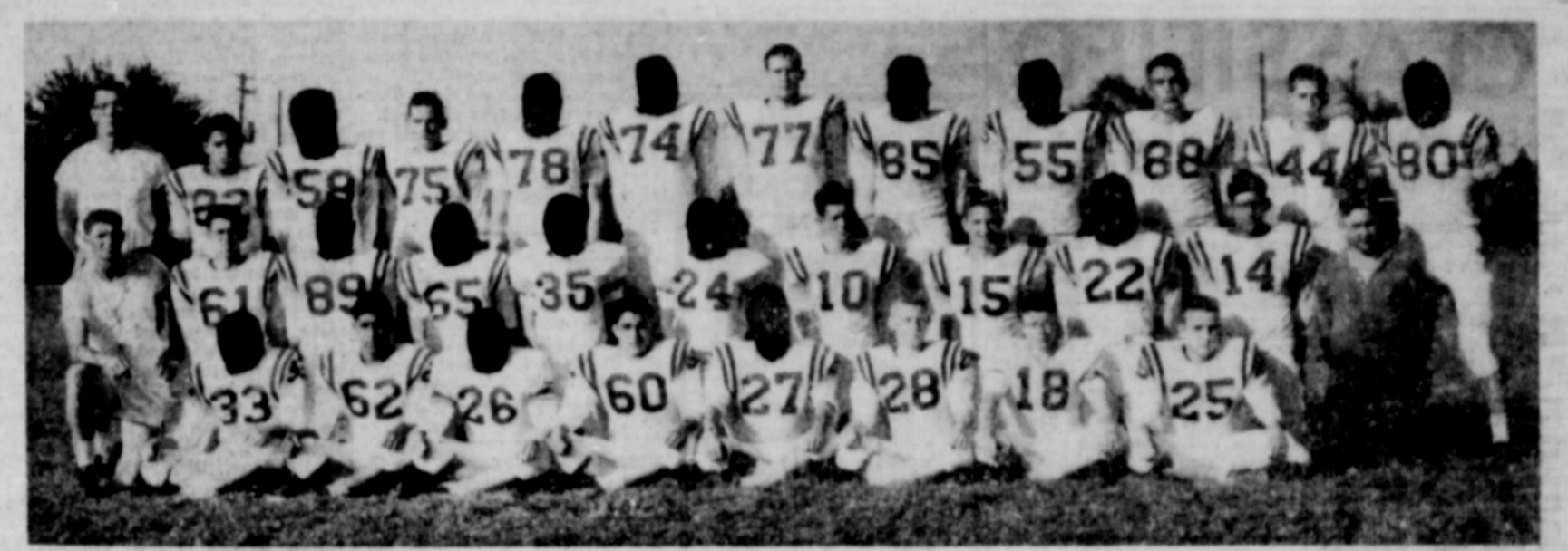
MYSTERY MEN? — No, but there is a mystery about who will fill the vacant spots on this year's Ranger High School football team. Pictured is last year's team with 14 faces blacked out, showing the shortage created by the loss of eight starters and six squadmen. This is the problem facing the Bulldog coaching staff at this time.