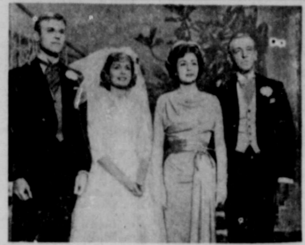
BRIDAL PARTY: Fred Astaire and Lilli Palmer, right, are the parents of Debbie Reynolds, bride of Tab Hunter in Periberg-Seaton's "The Pleasure of His Company," showing Sunday and Monday at the Majestic. A Sneak Preview will be shown at 7:20 Sunday night. See both shows at no extra cost.