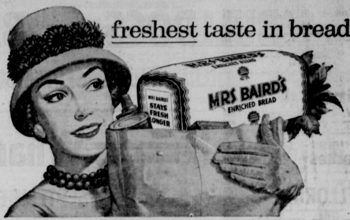
freshhest taste in bread