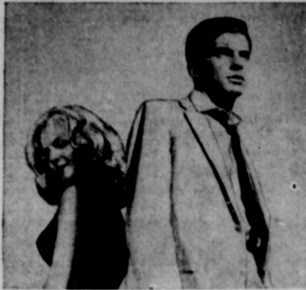
George Hamilton and Salome Jens in a scene from "Angel Baby" showing Sunday thru Tuesday at Your Ranger Drive In Theatre.