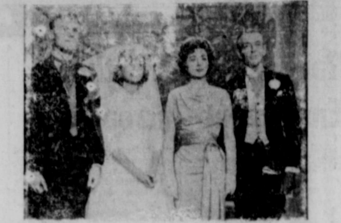
BRIDAL PARTY: Fred Astaire and Lilli Palmer right, are the parents of Debbie Reynolds, bride of Tab Hunter in Perleberg-Seaton's "The Pleasure of His Company," now playing at the Majestic thru Monday. Co-starring Gary Merrill and Charlie Ruggles, the romantic comedy is a Paramount release in Technicolor.