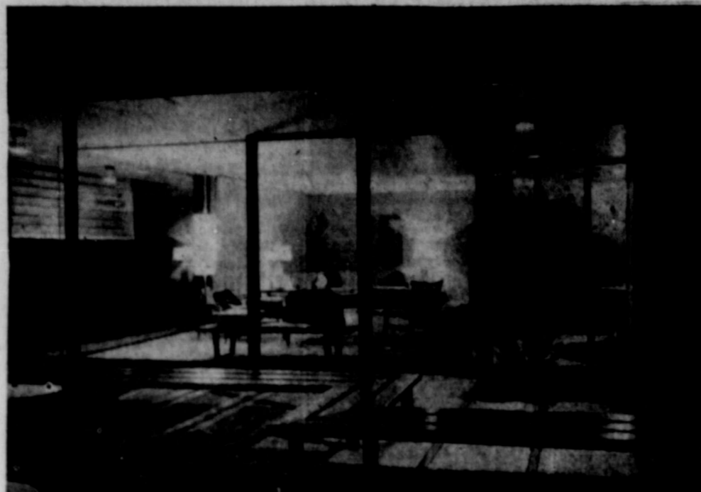
BALANCING FURNITURE ARRANGEMENTS to make a room attractive from the patio as well as from inside the house, is stressed by designers as a means of doubling living enjoyment in modern Thermopane glass-walled homes. Sofas and occasional chairs are arranged against an inside wall or in "free-standing" groupings which allow easy traffic flow within the room and do not block the view from either the patio or the living area.