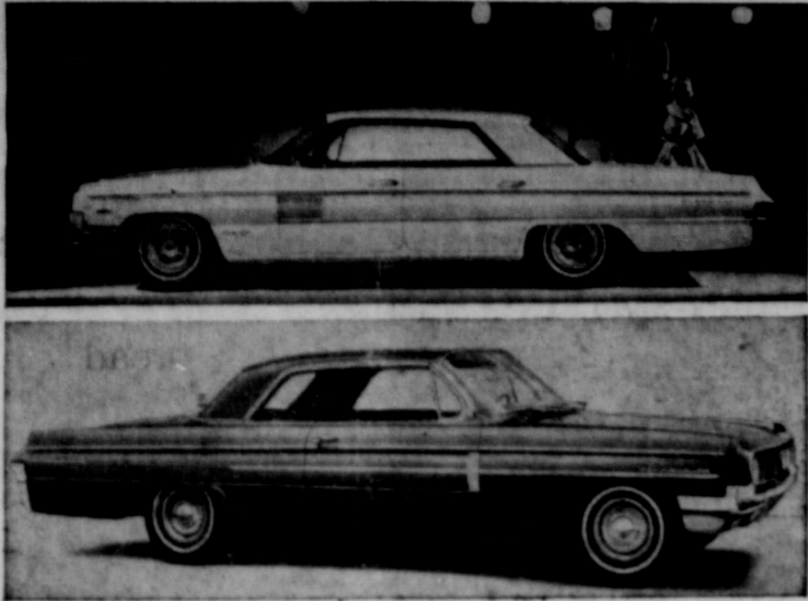
OLDS FOR '62 with its roof styling, the elegant, new Oldsmobile Holiday Sports Sedan for 1962 (top photo) combines the exciting look of a sports coupe with the roominess and full convenience of a four-door model. In addition to a completely new front