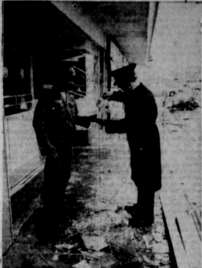
COFFEE TIME—Symbolic of the relief that's pouring into the Coastal area after Hurricane Carla's havoc, is this cup of coffee being poured by a Salvation Army officer for a National Guardsman, who was called out to assist.

Next scheduled meeting for the group will be on Monday, Oct. 2.