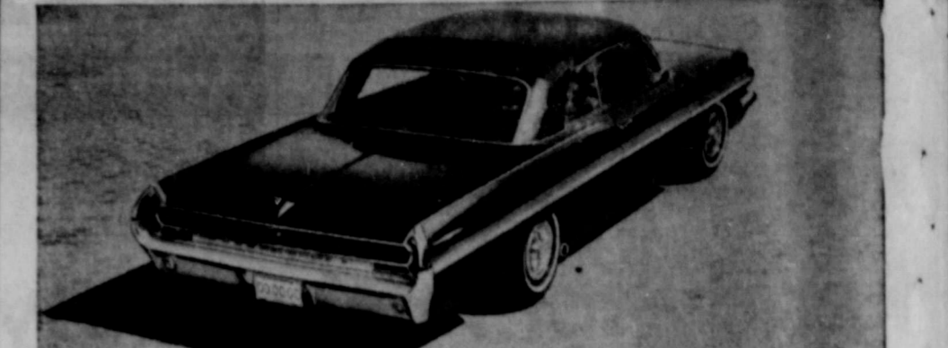
LUXURIOUS STYLING—Pontiac's 1962 sports coupe model is graphically illustrated by these views of the sparkling new Bonneville. A smaller rear window and a lower roof design give this two-door hardtop the rakish look of a softtop convertible. A divided V-shaped grille of horizontal bars exemplifies the smooth flowing lines and the Bonneville's generous full-length side moulding accents the car's long, and sleek appearance. This same new look in hardtops is found in the Catalina sports coupe to go on sale Thursday at Bagwell Motor Co., Pine and Rusk, Ranger.

Additional engine options offer compression ratios up to 10.75:1 and a choice of two, four or triple two-barrel carburetion.