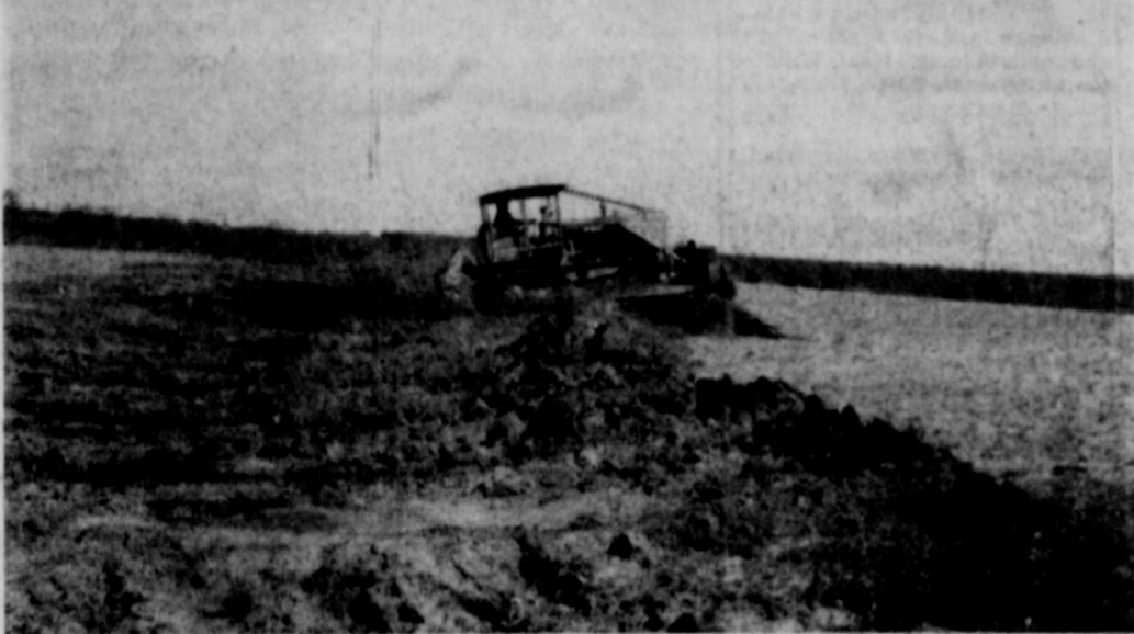
In this photo the bulldozer is making the first trip along the terrace pushing the dirt from the channel to the ridge of the terrace. Terrace channel has already been chiseled to loosen the soil.