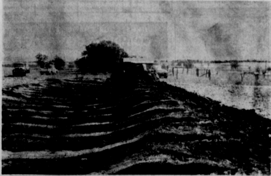
This photo shows the second trip with the dozer. The next step is the final grading of the terrace channel and bridge by running the dozer lengthwise of the terrace.