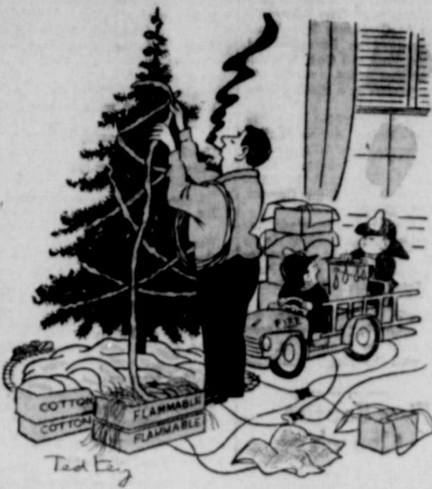
"GET SET. HE'LL BE NEEDING US SOON."