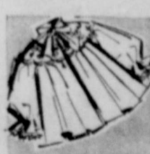
Dainty Bed Jacket