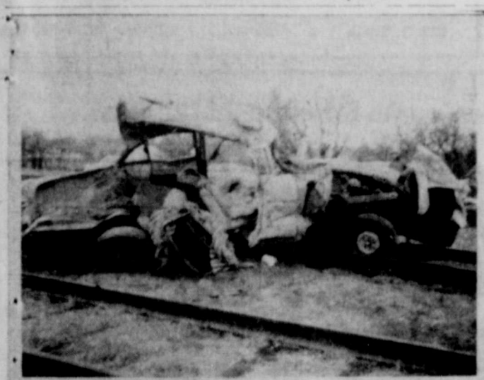
CRASH REMAIN —This shows the condition of the 1956 Chevrolet in which Jodie Robinson was killed in the crash with a Westbound T&P freight Tuesday in Eastland. This picture was made shortly after the crash, just before an Eastland wrecker pulled the wreckage from the track. The wrecked vehicle came to rest approximately 180 feet from the Daugherty St. crossing, site of the impact.