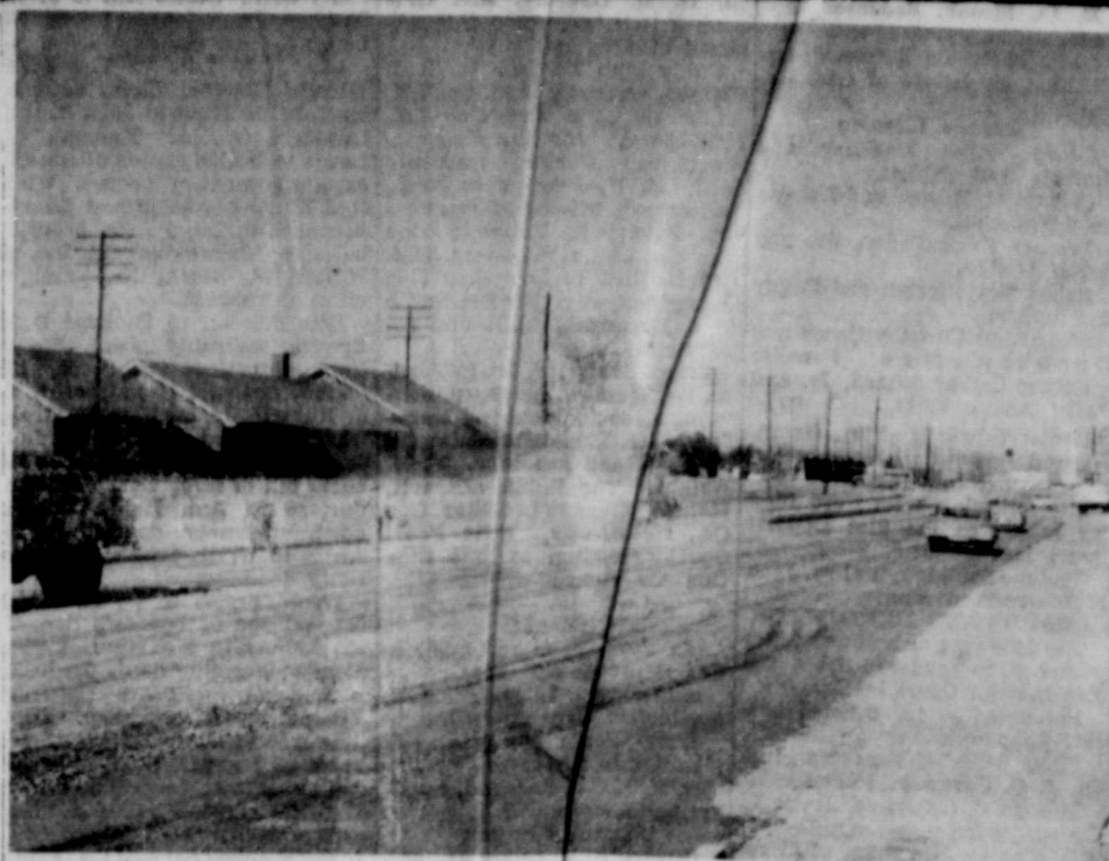
WORKMEN are pictured as they spread seal-coat on top of the first seal-coat sprayed on S. Highway 80, within the Ranger city limit. The paving project extends from Lake Leon Road, west of Ranger, to the Main Street crossing. Base for the new stretch of road is completed and, weather permitting, the final topping will be completed at an early date.