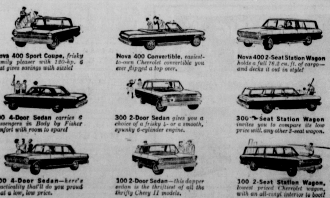
Nova 400 Sport Coupe , frisky family pleaser with 120-hp. 6 that gives savings with sized!

CHEVROLET New Chevy II Nova 2- and 4-Doors—plus a wonderful choice of other Chevy II models