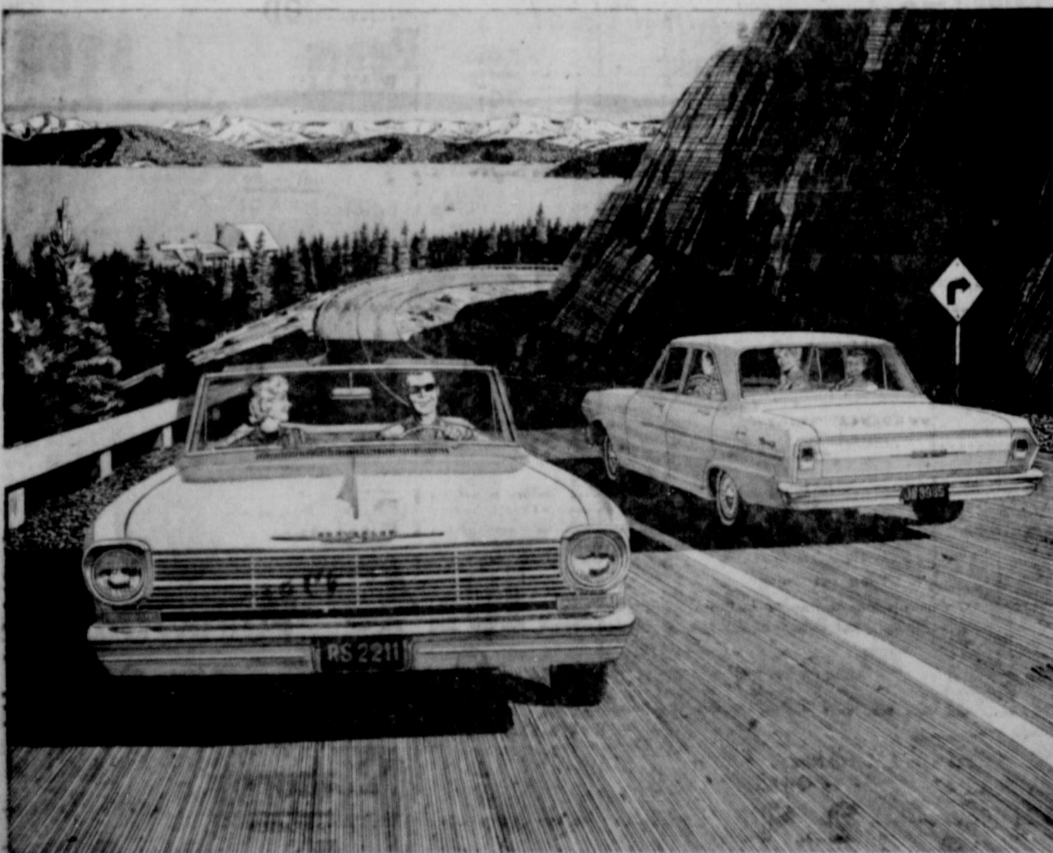
The sporty Chevy II Nova Convertible and sprightly 4-Door Sedan

See the new Chevy II at your local authorized Chevrolet dealer's