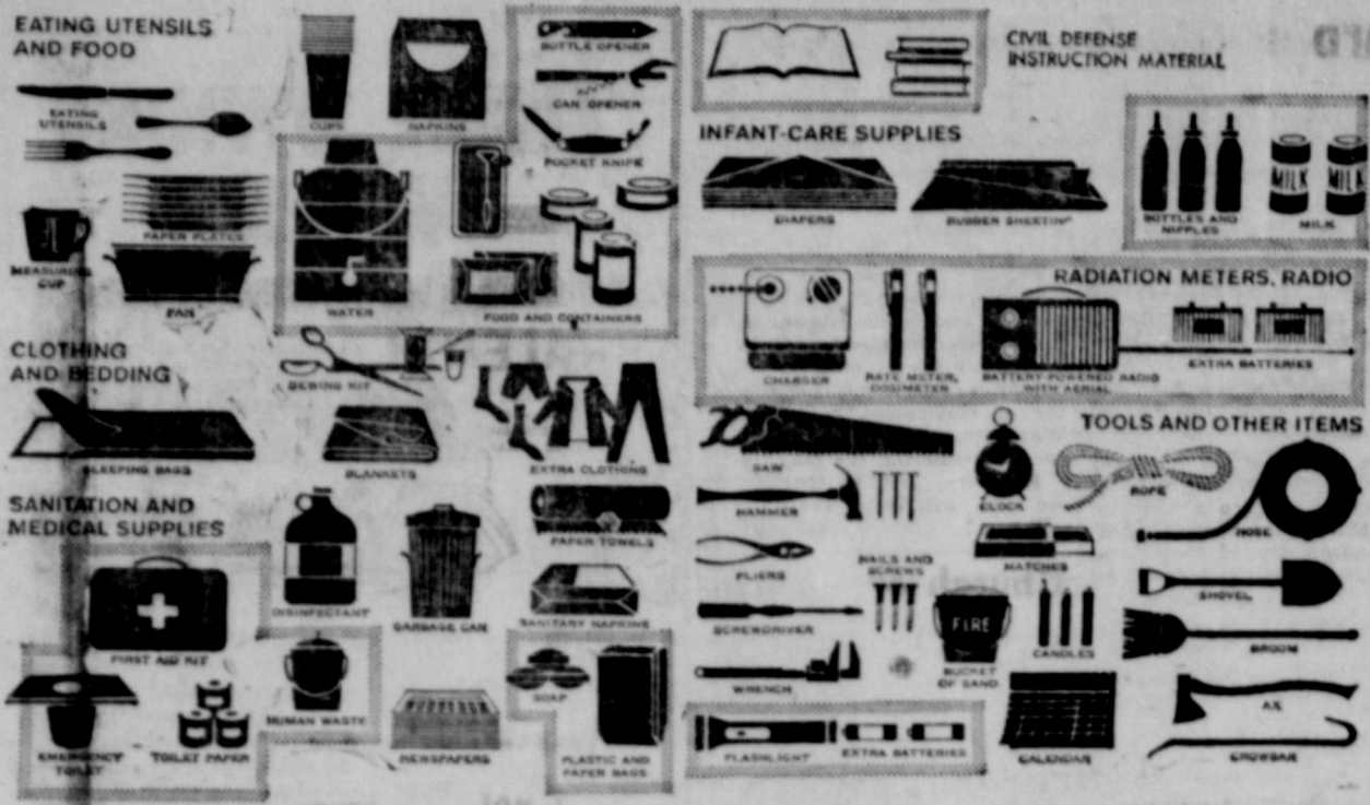
FALLOUT SHELTER supplies necessary to be self-sustaining over a two-week period are shown in these drawings from the "Fallout Protection" booklet prepared by the Department of Defense and available free to the public through post offices and local civil defense offices. The most essential supplies are outlined in gray, including water, the most important individual item. Each shelter occupant would require at least a quart of water a day, and a gallon would be better to allow for cleansing.