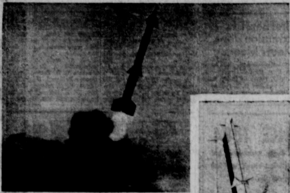
Minus 20 And Counting—NIKE ZEUS, the U. S. Army's anti-missile missile all set for launching at Point Mugu, Calif. FIRE! —on its way to a successful intercept of an electronically simulated target traveling at the speed of an intercontinental ballistic missile. This was done by feeding ICBM characteristics into the ZEUS system's target intercept computer. This test firing, another step in the continued progress of the NIKE ZEUS development program, is further proof of the ability of the nuclear capable NIKE ZEUS to provide active defense against ballistic missile attack on the United States.