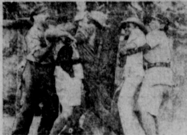
FRANK SINATRA (second from the right) gets into a brawl with guards in Columbia's 'THE DEVIL AT 4 O'CLOCK,' also stars SPENCER TRACY.

Prompt application filing is necessary because time is needed for each group to arrange for submitting samples