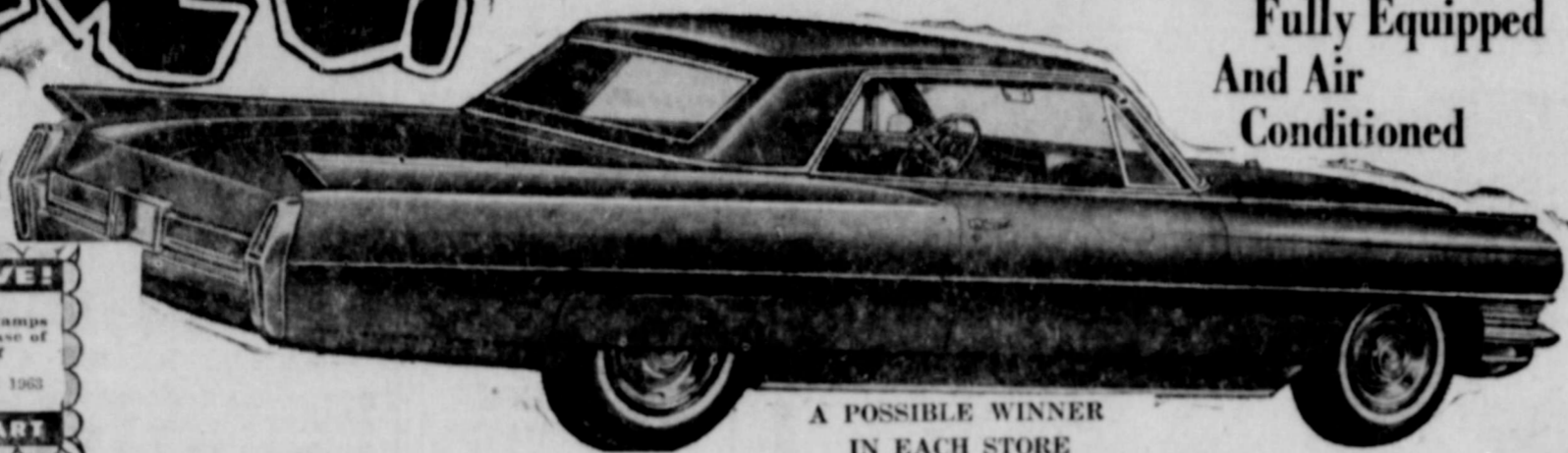
A POSSIBLE WINNER IN EACH STORE

PLAY GOLD RUSH BIG MONEY GAME WIN A 1964 GOLD CADILLAC or $5000 in Cash