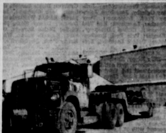
BIG ROLLING STOCK of the C&H Transportation Co., Inc., is shown above. A number of Ranger and area residents wheel these giant trucks over the nation. Bulk of the firm's business is hauling government freight.