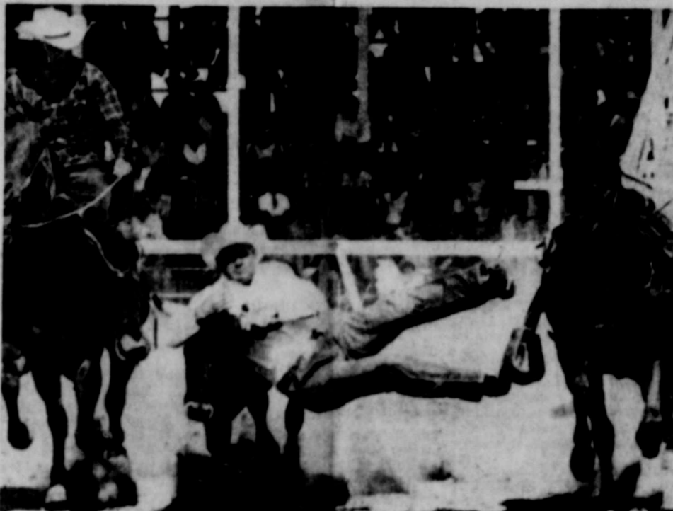
SIGHTS LIKE THESE await spectators during the second annual Ranger Junior College Rodeo held in local Jaycee Arena, beginning at 8 p.m. on Wednesday and Thursday, April 27-28.