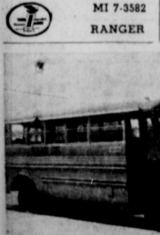
JUST ARRIVED — One of the two new buses to be used by Ranger Independent School District when classes resume in September.

PICKRELL Insurance Agency MI 7-3582 RANGER