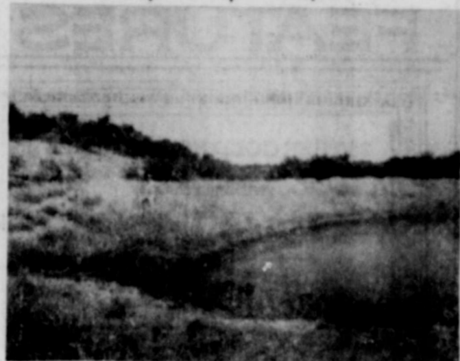
THIS FARM POND was built by A. D. Crawford on his ranch north of Desdemona. Livestock water was its primary purpose yet it has many other uses such as water for deer, other wildlife, a home for ducks during winter months and a good "fishing hole" where a man can relax and catch some good ones. Eastland County now has approximately 3400 such ponds. Note the good grass cover established on the dam and spillway.