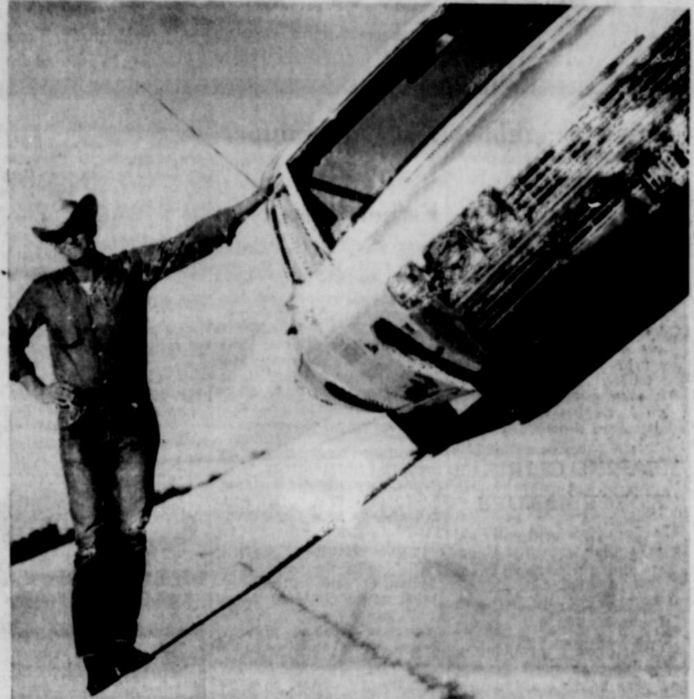
NEW SLANT ON TIRE TESTS — Man and machine cling to the steep bank of the high-speed track at the Goodyear Tire & Rubber Company proving ground near San Angelo, Tex. The bank balances side forces on a five-mile circular track so that cars testing tires at speeds of up to 140 miles per hour handle as though they are traveling on straight, level roads. The track is part of a 7,300-acre complex—the world's largest tire testing facility.