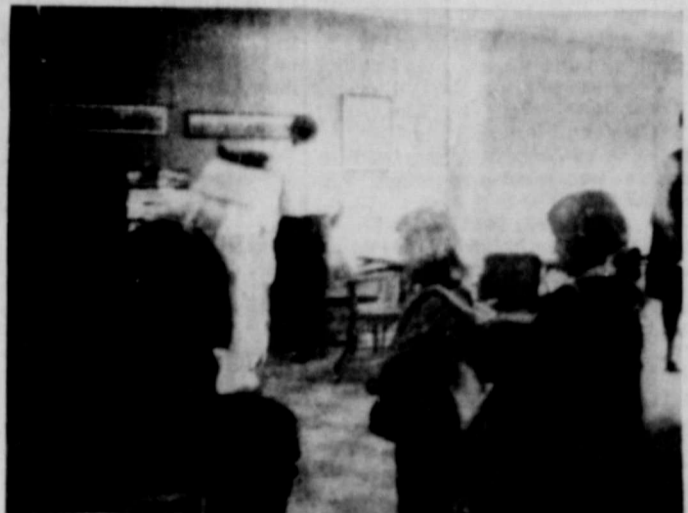
TAKING ORDERS for Christmas delivery — Santa Claus turns on his Magic Memory during a visit with local "small fry" at the Chamber Office Saturday afternoon.

Please enter my home (apartment) in your 1969 Christmas Lighting Contest. I understand only those home (apartments) in (designated area) will be eligible to compete. Name _____ Address _____ Fill above blank and mail or carry to the Chamber of Commerce office. Deadline for entering the contest is Monday, Dec. 15. A yard light will be awarded the best over-all home decoration with $5.00 going to the best window decoration and $10.00 for the winning door. Entries will be judged on Dec. 22.