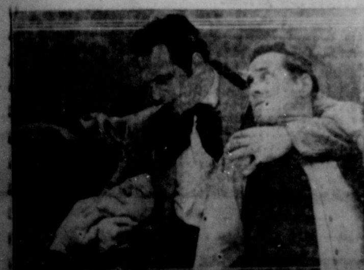
Scenes from "Unconquered Bandit" which plays Saturday at the Columbia Theatre.