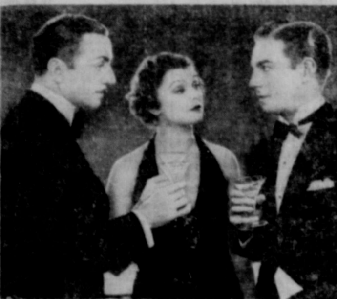
William Powell, Myrna Loy, Henry Wadsworth in "The Thin Man," coming to the Columbia Sunday.