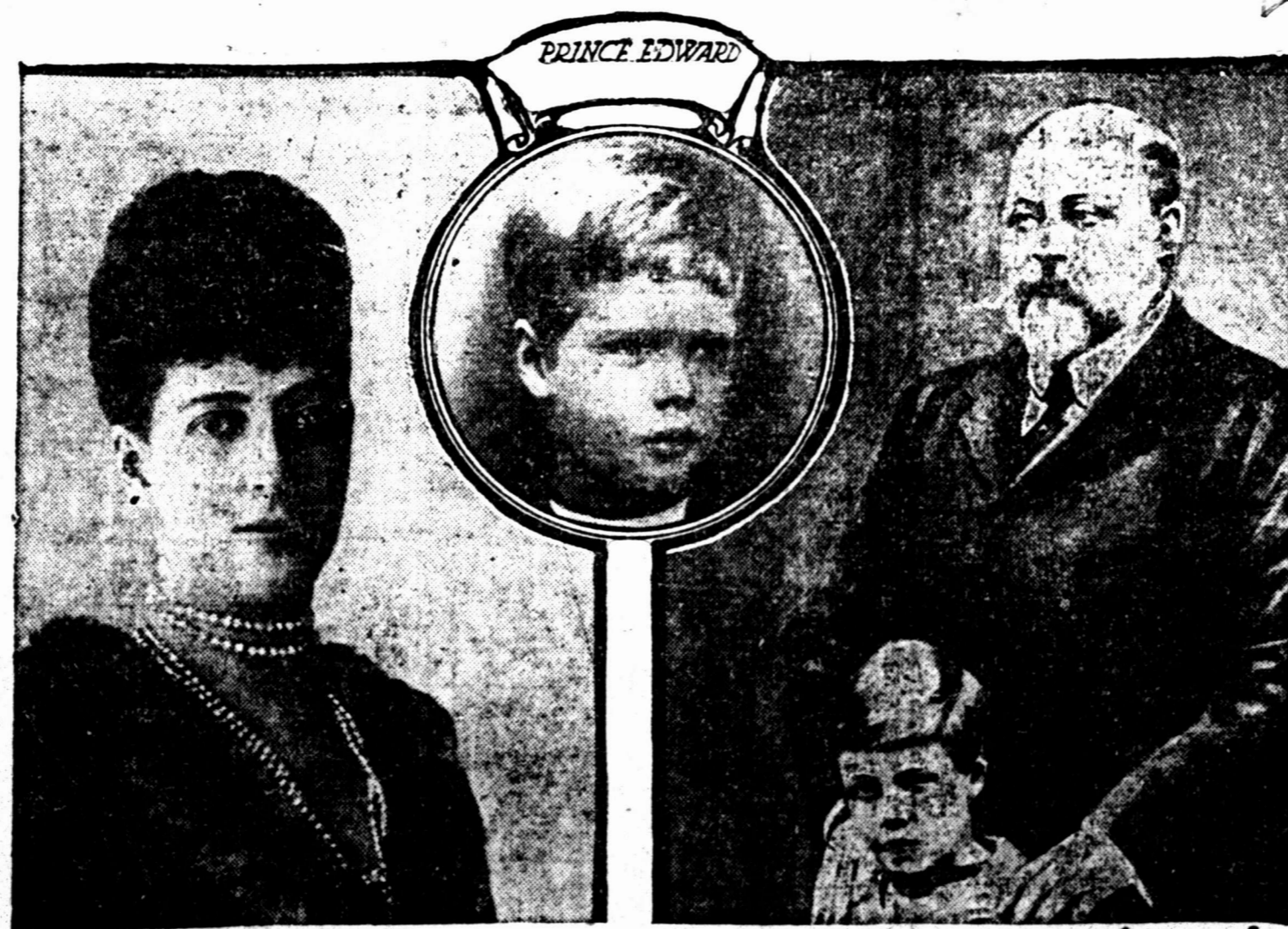
Here is the latest picture of the next Prince of Wales, who is the favorite grandson of King Edward. Above are also new photographs of Queen Alexandra and King Edward VII.

Interesting Photograph Showing the Boy Prince Who Will Become Heir Apparent Upon the Death of His Royal Grandfather. New Photographs of Queen Alexandra and King Edward VII.