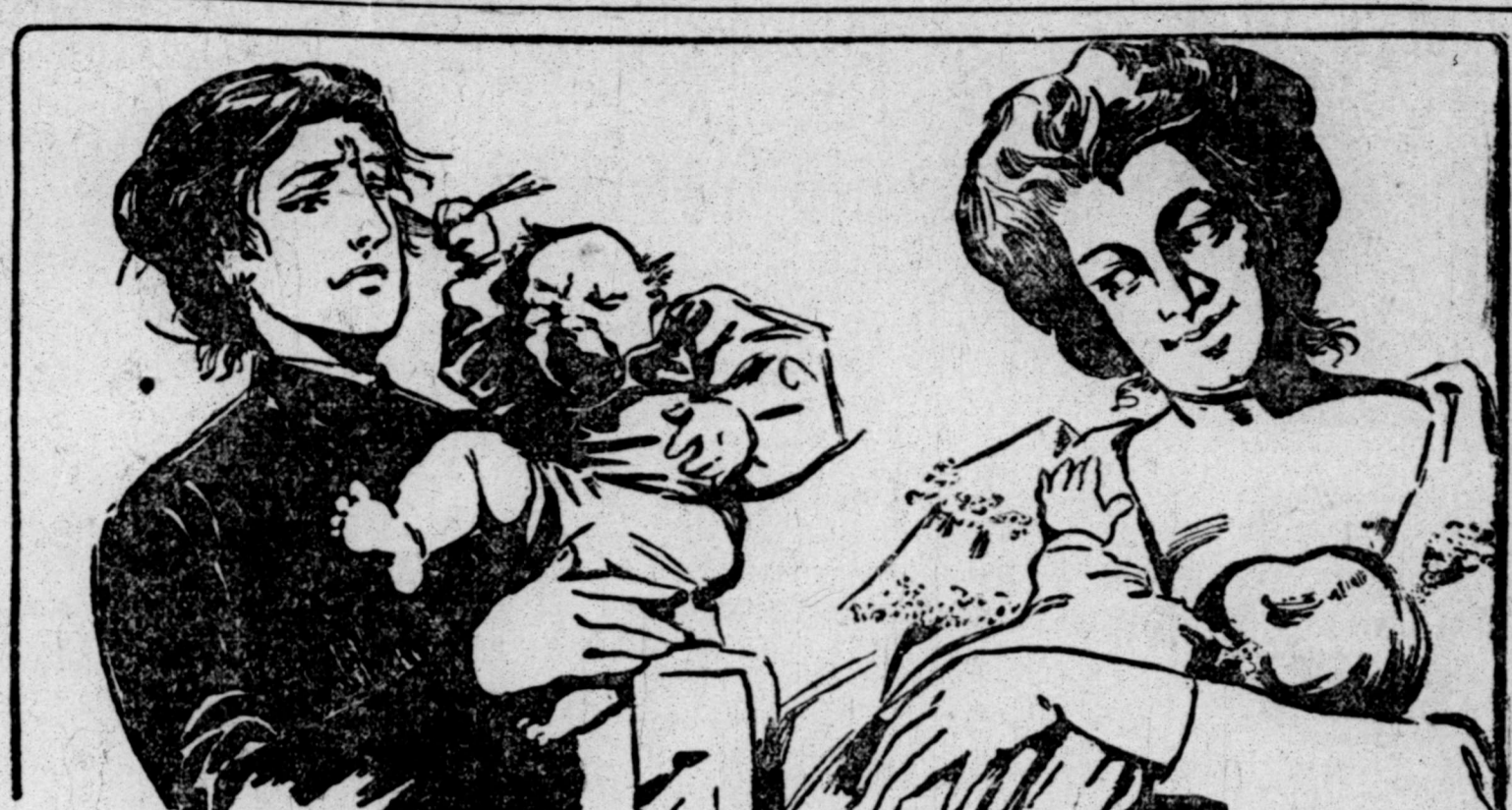
THE ONE WITH THE IMP—How in the world do you keep your baby so quiet and happy this dreadful trying weather? THE ONE WITH THE CHERUB—Why it's the easiest thing in the world. I take a CASCARET Candy Cathartic every night at bed-time...