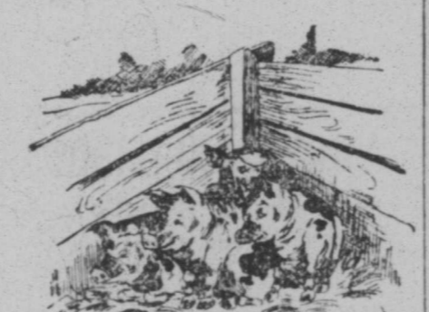
A "CORNER IN PORK."