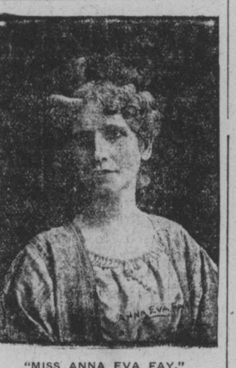
"MISS ANNA EVA FAY."

THE KNOWLES The Knowles again delighted a large crowd at Greenwall's last night with their exhibitions of the power of hypnotism. An enjoyable part of the entertainment is that only the simpler forms of hypnotic influence are attempted and the amusing feature is emphasized in a singularly harmless and inoffensive way. At times last night it was hard to tell whether the crowd on the stage or the one in the audience was most under the spell, for the one could not stop doing what was suggested by the operator, while the other could not stop laughing at what was done. The entertainments will continue nightly with a variation of experiments each evening. ANNA EVA FAY COMPANY. Anna Eva Fay will be the attraction at the Greenwall opera-house next week, commencing Monday night, April 13. Miss Fay delighted and mystified large audiences on her previous appearance in this city. Miss Fay gives a clever performance of its kind, and as the public is always asking extraordinary entertainment, evidently the people are just as curious to see