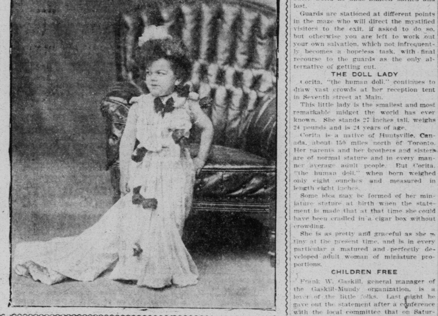
The smallest matured woman in the world. One of the prettiest features of all the Gaskill-Mundy shows and the undoubted sensation of the age.

HOME WEEK IS HALF WAY DONE CROWDS VISITING THE CITY GROW LARGER NEAR THE END