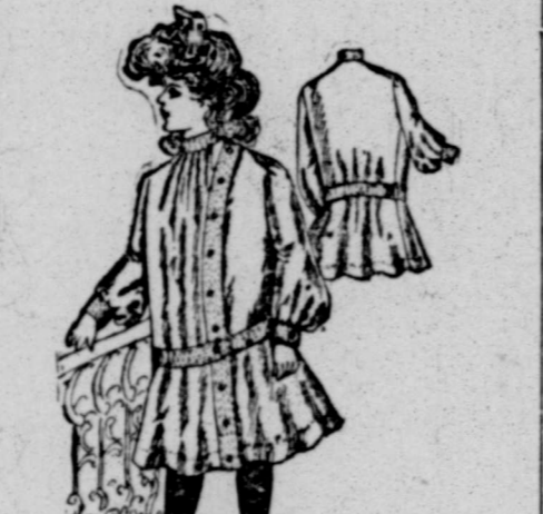
4645 Child's Russian One Piece Dress, 4 to 10 years.

Roll on Forever If you would look well, feel well and keep well, use Beecham's Pills. Sold Everywhere. In boxes, 10c. and 25c.