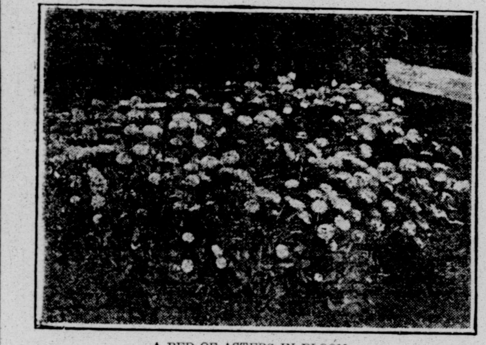
A BED OF ASTERS IN BLOOM.

Unless a person knows something about flowers the task of selecting seeds for next summer's garden is likely to be a perplexing one. Nothing is more bewildering than the modern catalogue of the florist. There are so many kinds of flowers described in his list, which shall he decide on? He looks over his garden and makes a mental estimate of how many flowers he has accommodations for, and finds that he has not room for anywhere near the number he has marked as wanted on the pages of his catalogue. The list must be revised and cut down to fit the garden. But—what shall be omitted? That's the puzzling question.