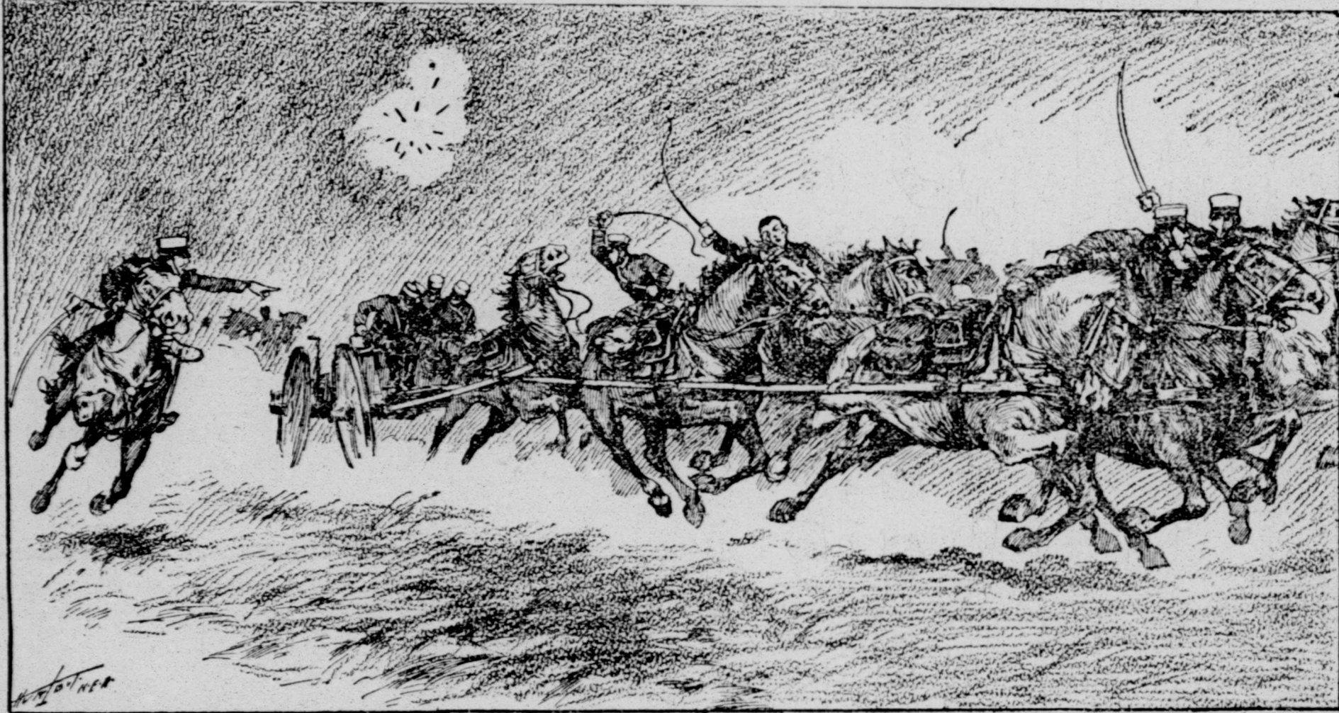
Under ordinary circumstances four horses draw field artillery, but when artillery takes the field for business purposes, the "war allowance" of six horses is used.