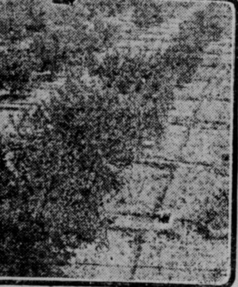
Irrigating the Orange trees.