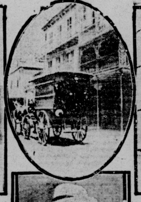
A "WALKING CASE" PICKED UP BY POLICE.

STEAMER DETAINED NEW YORK, Aug. 5.—The steamer Ligonier from Fort Arthur, Texas, is detained in quarantine and one member of the crew has been removed to Hoffman island for observation.