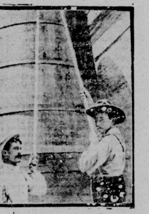
A "WALKING CASE" PICKED UP BY POLICE.

STEAMER DETAINED NEW YORK, Aug. 5.—The steamer Ligonier from Fort Arthur, Texas, is detained in quarantine and one member of the crew has been removed to Hoffman island for observation.