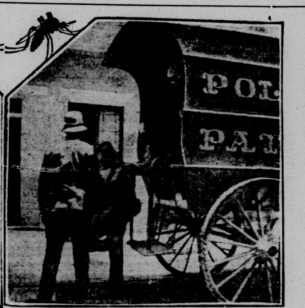
A "WALKING CASE" PICKED UP BY POLICE.