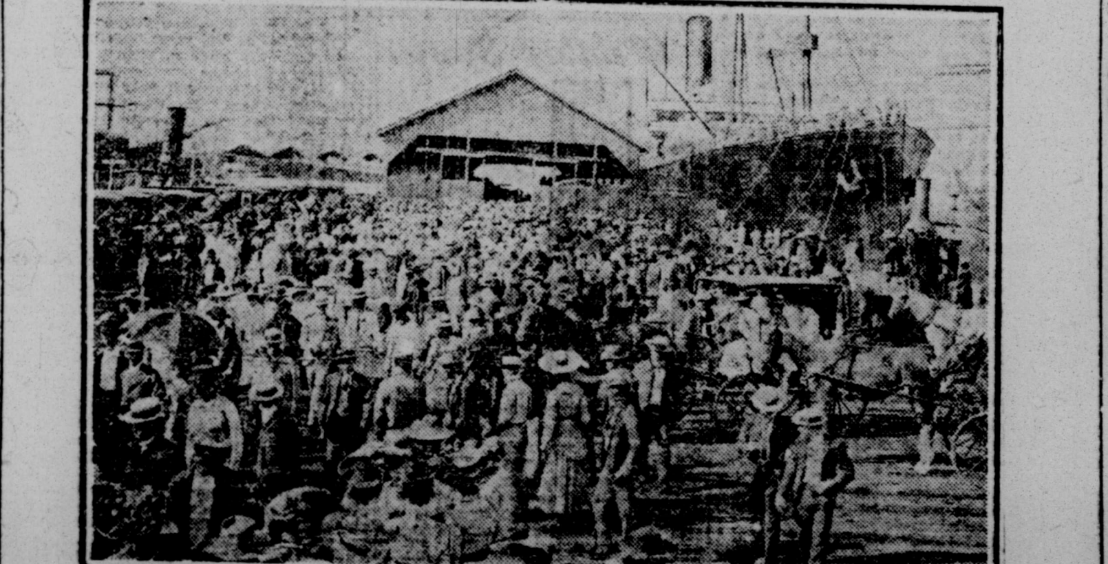
This is the scene at the docks when the steamship Manohurian landed. The crowd was not allowed to enter the dock proper, and turned away in disgust at the arrangement, but lined up outside to see the party of official pilgrims to the far east drive from the dock to their hotel.