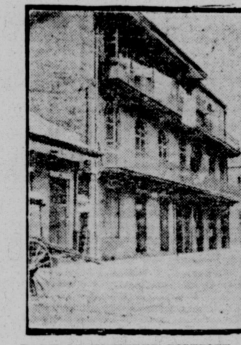
PART OF INFECTED DISTRICT.

STEAMER DETAINED NEW YORK, Aug. 5.—The steamer Ligonier from Fort Arthur, Texas, is detained in quarantine and one member of the crew has been removed to Hoffman island for observation.