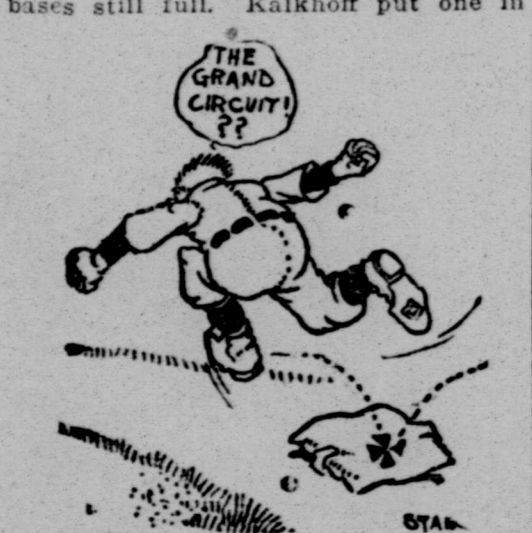
IN THE SEVENTH.