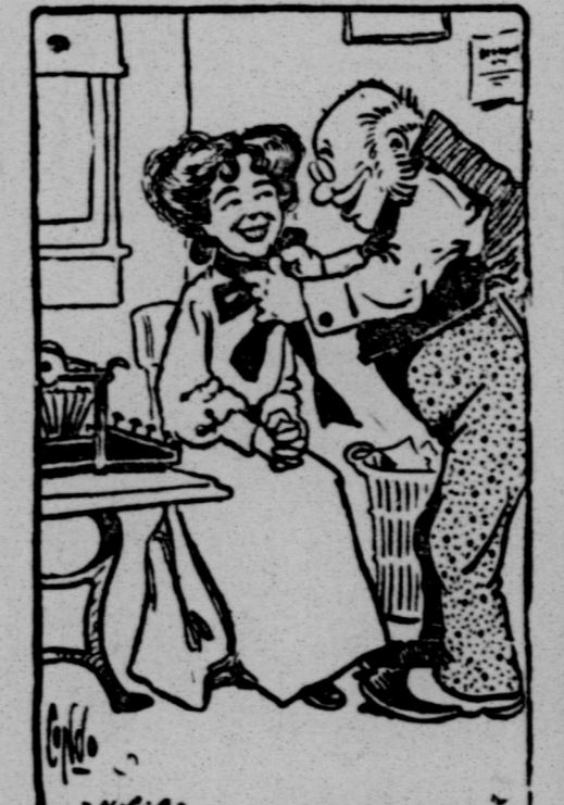
PUTTING A NEW RIBBON ON HIS TYPEWRITER.