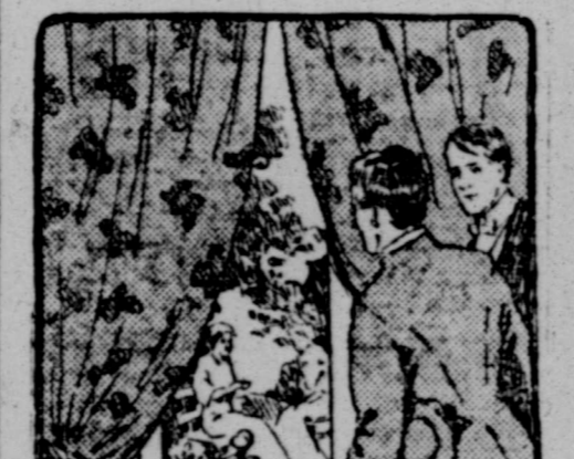
"THAT LADY—WHO IS SHE?"

When it became known in North-towers that the successor to dear old Canon Gregory was not only a bachelor, but a man of comparative youth, being not more than five-and-forty, the feminine population of the old place was highly excited; speculation was rife in the old city, and many a feminine eye turned longingly toward the old house which stood at the extreme west corner of the cathedral square.