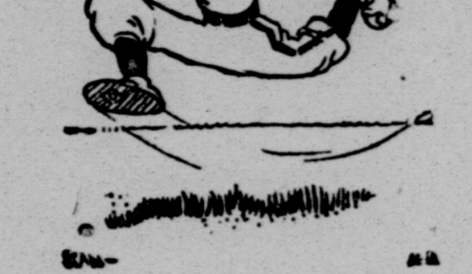
GRORER IN ACTION.

The new remedy was turned loose on two occasions in the Haynes Cotton