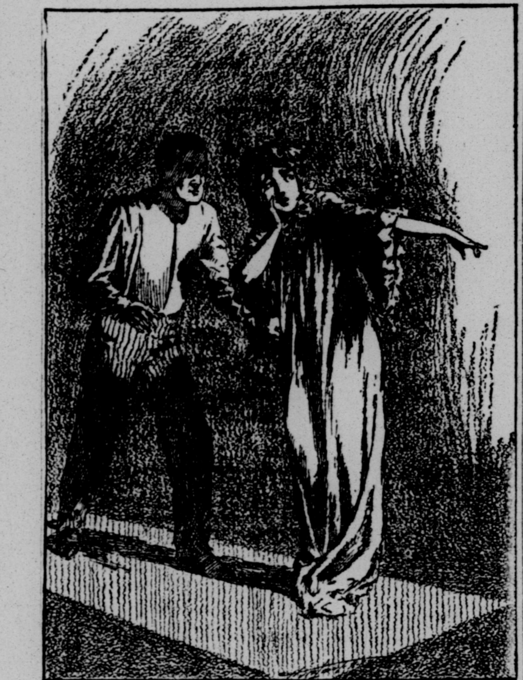
"I FOLLOWED THE DIRECTION OF HER FRIGHTENED GAZE."

Optimism is thinking you are happy when you are only resigned.