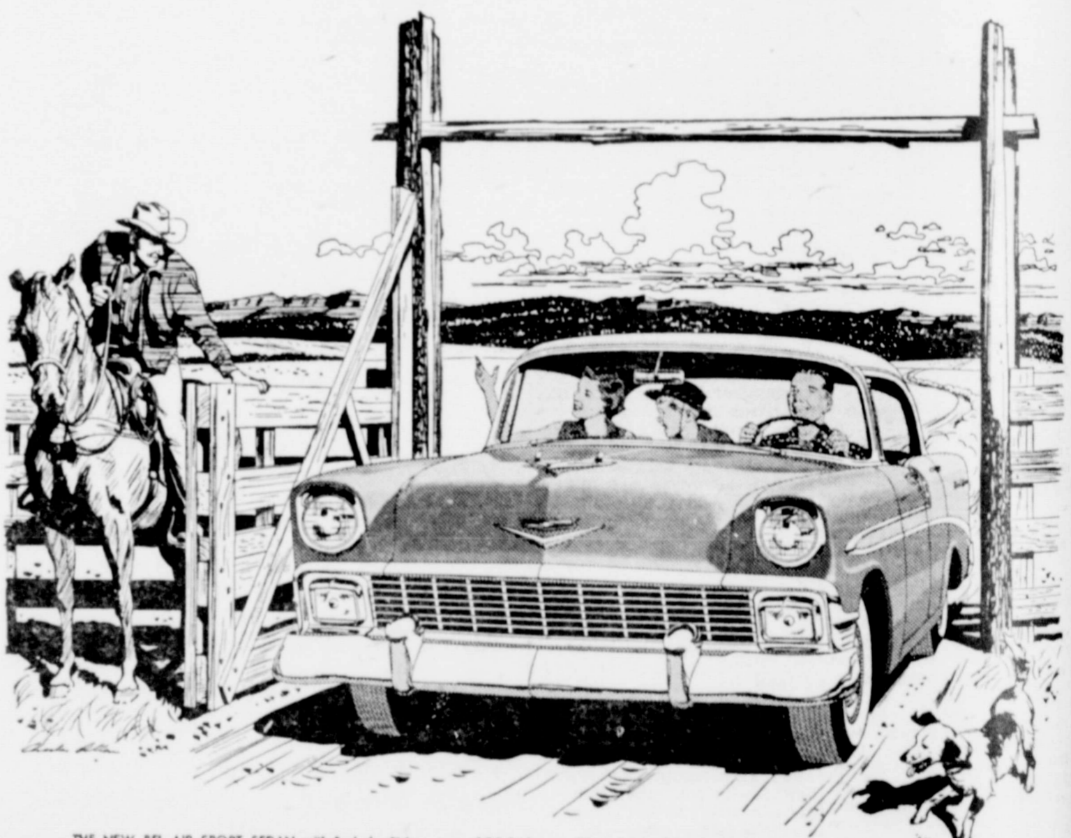
THE NEW BEL AIR SPORT SEDAN with Body by Fisher—one of 20 frisky new Chevrolet models.

If you hear a thump... it's only your heart!