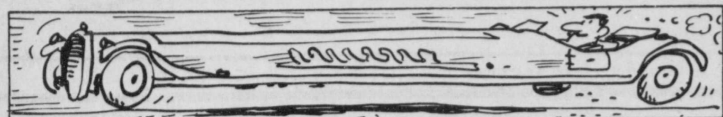
The largest car ever built was the Bugatti "Royale" of which only six were made. It measured over 22 feet in length and the hood alone was over 7 feet!

ization of homes of the elderly and poor by weather stripping, insulation, repair of windows and doors and roof patching to minimize heat loss in or improve thermal efficiency.