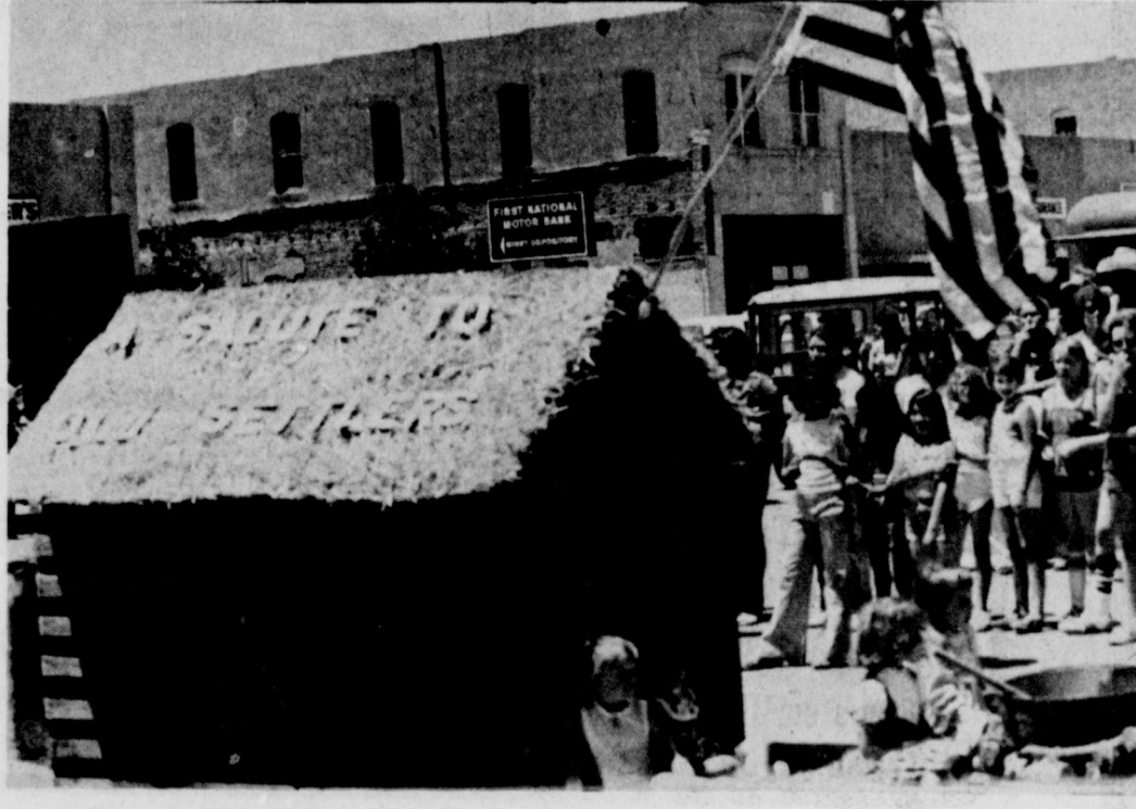
"A SALUTE TO OLD SETTLER'S" was the theme of the Producers Co-op float.

These memorials go toward equipment to help serve our community in the best way possible.