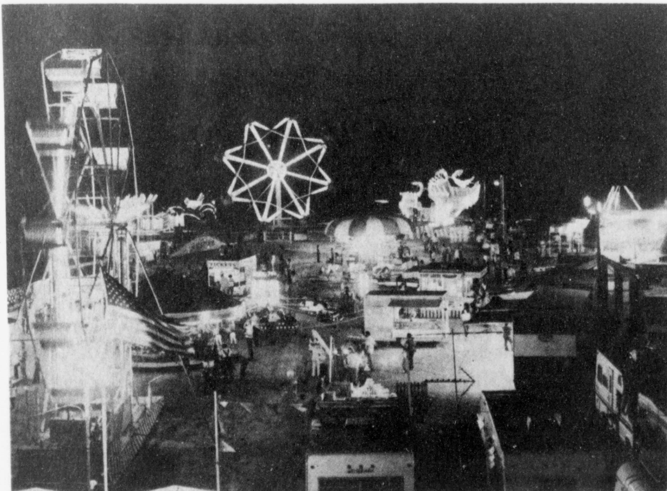
Jest Amusement Carnival