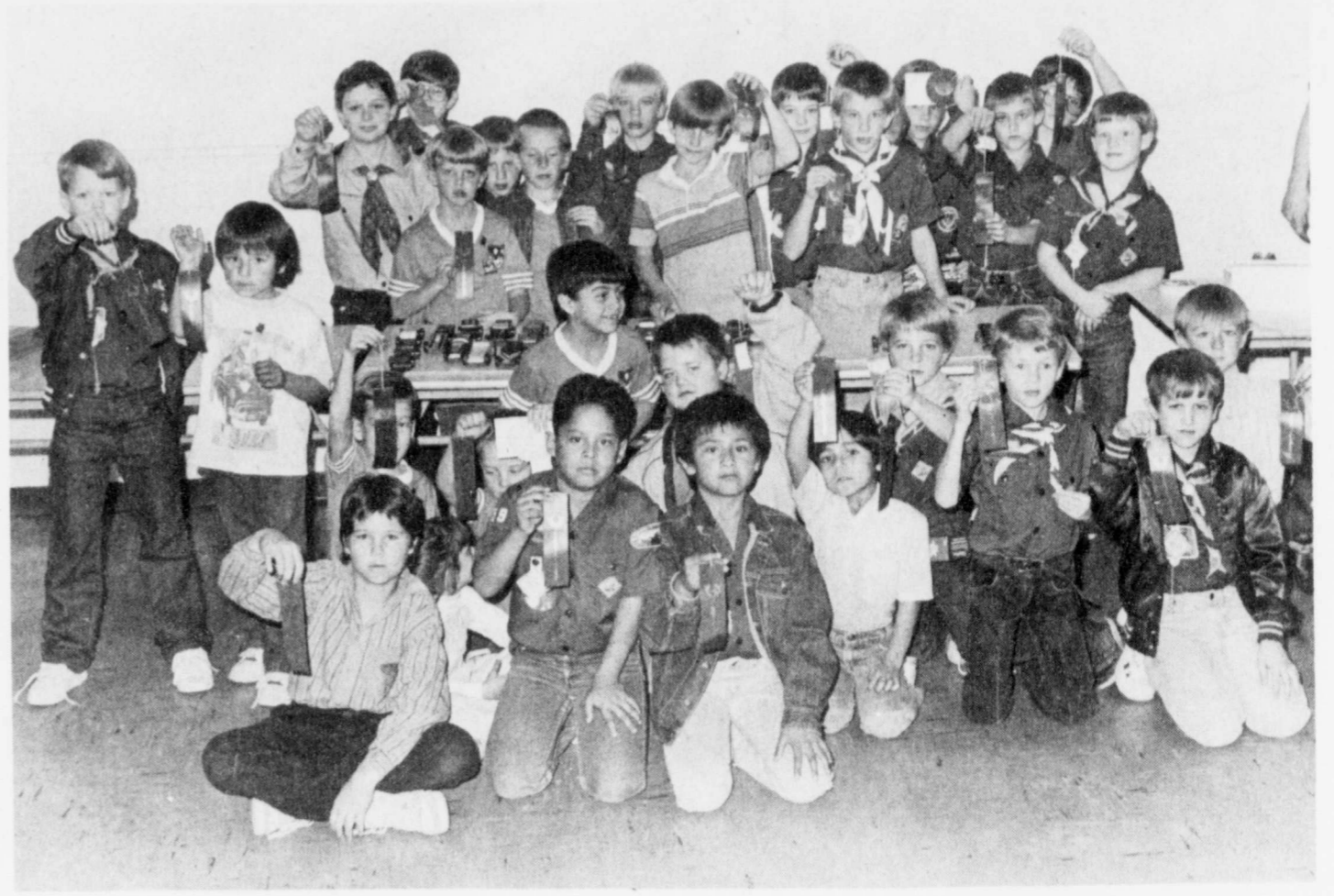
EVERYBODY WINS--All 27 Lockney Cub Scouts who raced cars in the second annual Pack #259 Pinewood Derby received participation ribbons.