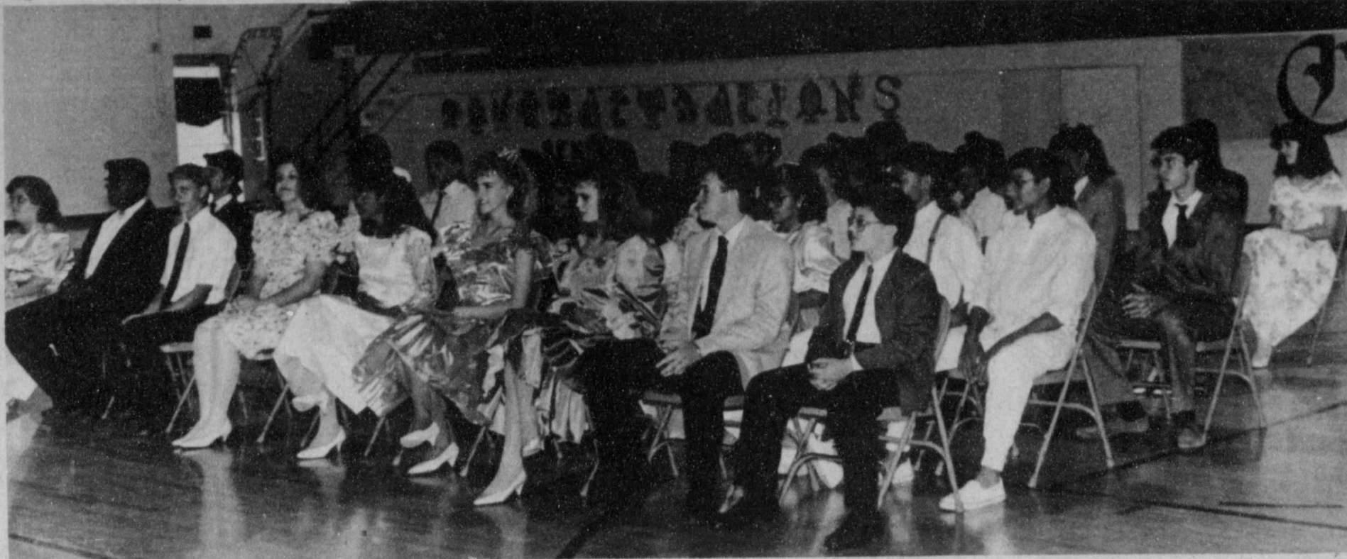
FORTY-ONE STUDENTS GRADUATE FROM 8TH GRADE --41 Lockney Junior High students were graduated from the eighth grade in ceremonies held Tuesday, May 30th in the Longhorn Gym. After the awards ceremony, in