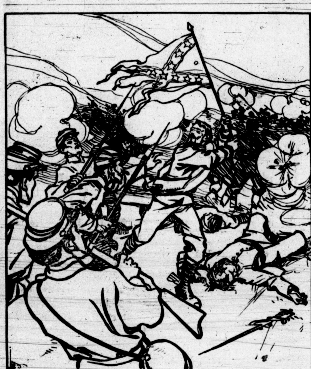
SAVING GREGG'S BATTLEFLAG

The cannoneers in Gregg stood to their guns gallantly. Three men were shot dead, one after another, in the attempt to discharge a single piece. When the assailants reached within forty a stinging volley, causing them to waver and then give way. A second charge followed, and the assailants Battery Gregg, which was an outlying let go, sepding down a man for every