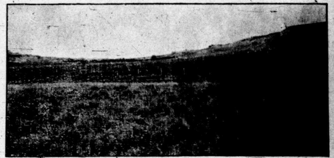
A Scene near the head of Palo Duro Canyon.