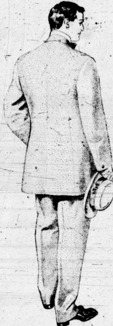
Copyright 1907 The House of Kuppenheimer Chicago

to look a customer straight in the eye and tell him straight from the heart that we will make good any suit bought of us that should prove unsatisfactory bearing the name of.