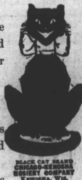
BLACK CAT BRAND CHICAGO-GENEVA HOSIERY COMPANY KENOSHA, WIS.

50 cent grade at 40 cents 25 cent grade at 20 cents 15 cent grade at 10 cents