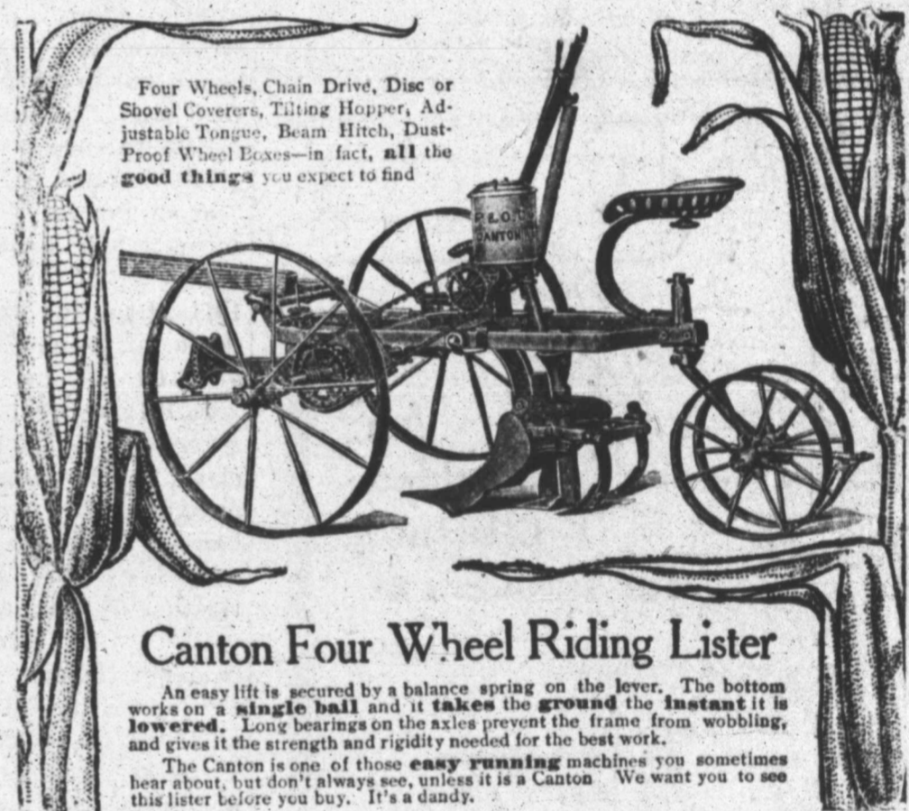
Canton Four Wheel Riding Lister

We have a complete stock in both one and two row, of P. & O. and John Deere. Both in shovel and disc covers, with all modern improvements to make them the easiest to handle, lightest draft, longest life and many other advantages over other listers on the market too numerous to mention. Come in and let us show you before you buy. Bear in mind the OLD RELIABLE makes.