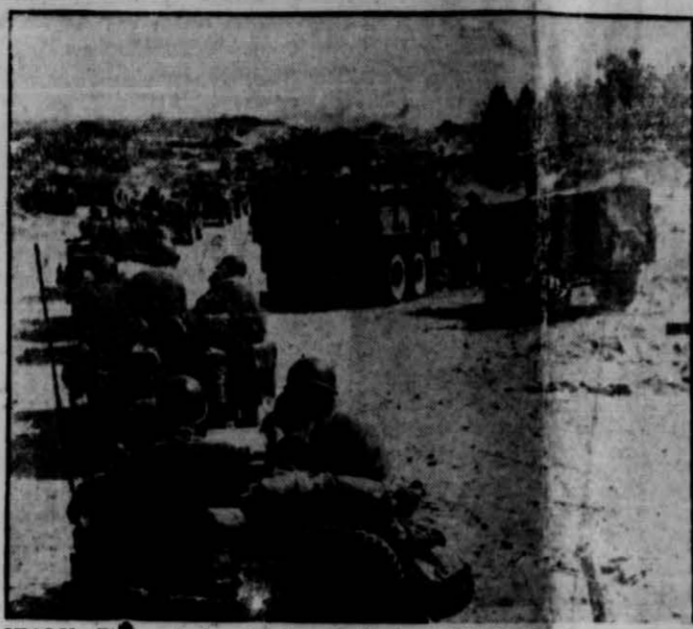
ITALY—The road already cleared of mines, Allied soldiers jam a long column of jeeps that head for the fighting lines. This party was one of the first to engage enemy troops in the battle on the Italian mainland.