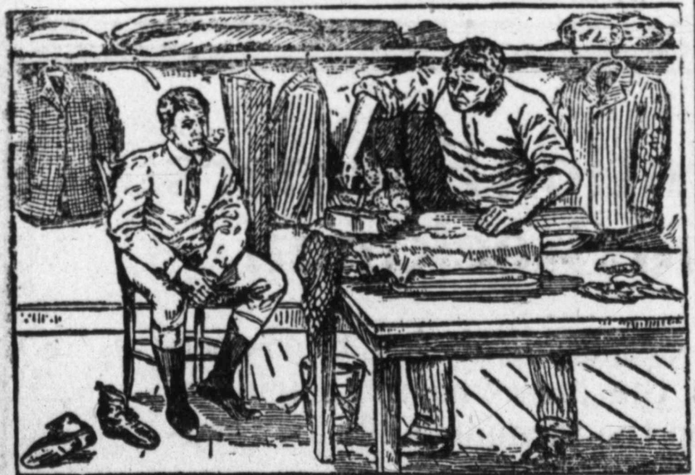
The Other Man's Way