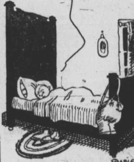
RANDALL COUNTY NEWS CANYON, TEXAS

OB-OY! OB-OY! I'M ALL IN! WHY CAN'T FOLKS LOOK OVER THEIR STOCK OF ENVELOPES 'N PAPER 'N STATEMENTS 'N ORDER WHAT THEY'RE GOINTA NEED INSTEAD OF WAITIN' UNTIL THEY'RE ALL OUT 'N THEN RUSHIN' TH' POOR PRINTERS 'N POOR LIL MICKIE 'T PIECES 'O' OH, BOY! 'S A CROOL 'O' WORLD!