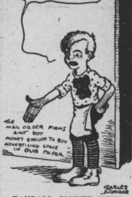
RANDALL COUNTY NEWS CANYON, TEXAS

THE REASON SO MANY FOLKS SEND AWAY FOR STUFF IS BECAUSE THE MAIL ORDER HOUSES 'N BIG CITY STORES ARE ALWAYS ADVERTISING AN' HUSTLIN' FOR THEIR BUSINESS. OUR OWN STORE KEEPERS KIN KEEP 'EM TRADE RIGHT HERE AT HOME BY STEADY ADVERTISING IN THIS PEEERLESS PURSUEVOR OF PUBLICITY! YESSIR!