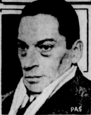
Comedy Costs Wife

LOS ANGELES . . . Ned Sparks (above), won fame as a "grouchy" husband in movie comedies. His wife was given a divorce last week on the ground that he had developed the same "ingrown" disposition at home.