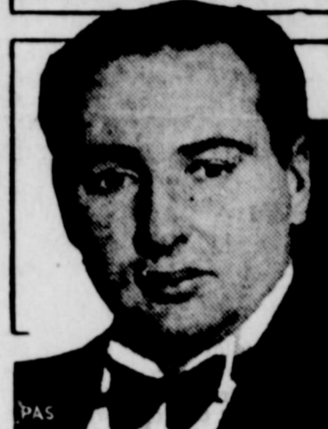
Denies "Overthrow" Talks

CHICAGO . . . John Strachey, British author, (above), who faced deportation charges here of advocating the overthrow of the American government in his lecture tour. He denied the charges.