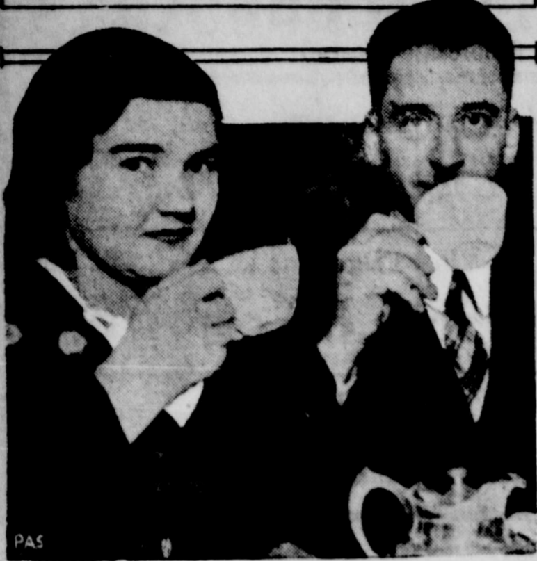
Now World's Most Famous Father and Mother

CHICAGO . . . Above are Mr. and Mrs. Oliva Dionne, parents of the famous Canadian quintuplets, who were prevailed upon to come down to the United States and enjoy the hospitality of America's "Windy City." Despite the thrills of big city life, Mrs. Dionne soon announced that she was homesick for her children, the quintuplets and the other five little Dionnes back home.