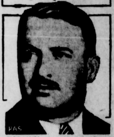
On Quintuplets' Behalf