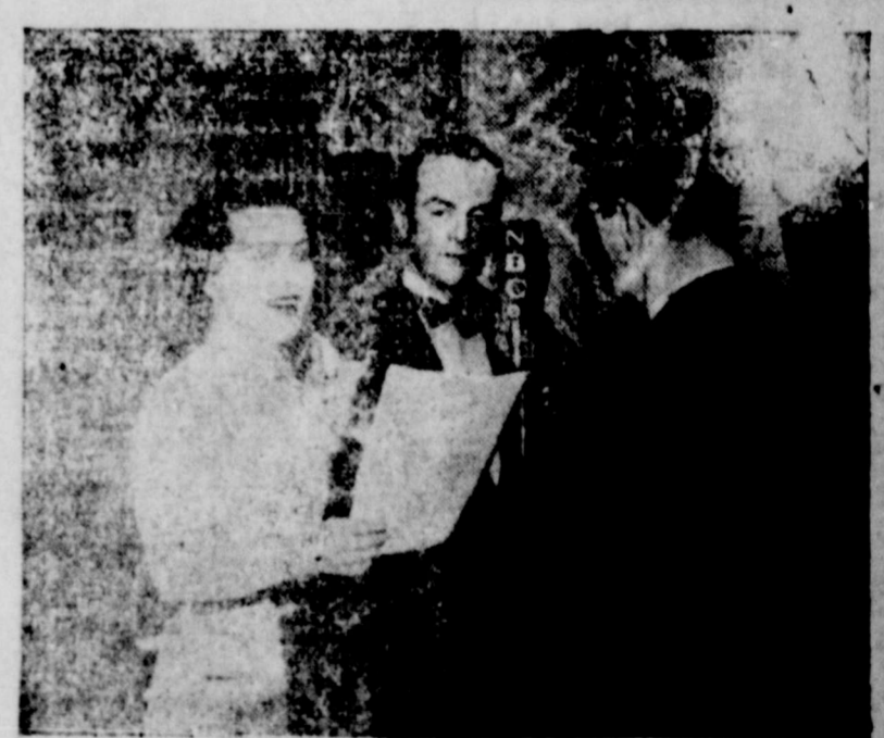
"You're The Top," Editors Tell Star in Poll