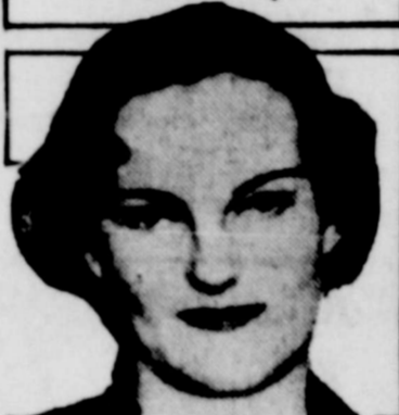
On Her Honeymoon