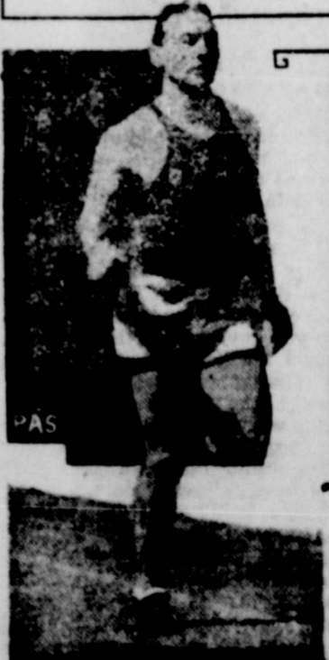
World's Fastest Miler

NEW YORK . . . It took two big seasons for Glen Cunningham (above), famous Kansas track star, to prove he is the fastest human ever to run the mile race. He has run 6 of the 12 fastest miles ever stamped by humans. The fastest mile was 4:06.7.