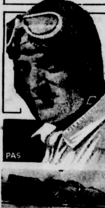
Aims at 300 Miles

DAYTONA BEACH, Fla. . . . A closeup view of Sir Malcolm Campbell, noted British auto speedster, who is tuning up his "Bluebird" racer here, hoping to set a new world record of 300 miles an hour, or better.