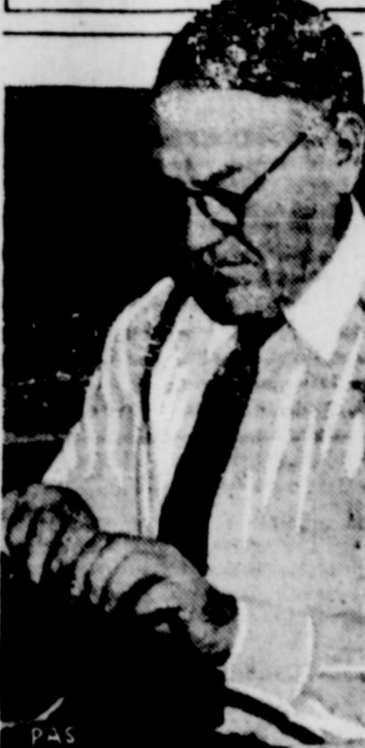
From Sweet to Piss

NEW YORK . . . Gen. Hugh B. Johnson (above), soldier and former NRA Chief has joined the ranks of American newspapermen, to produce a 500 word column, six days a week. He will write on current topics, it is stated.