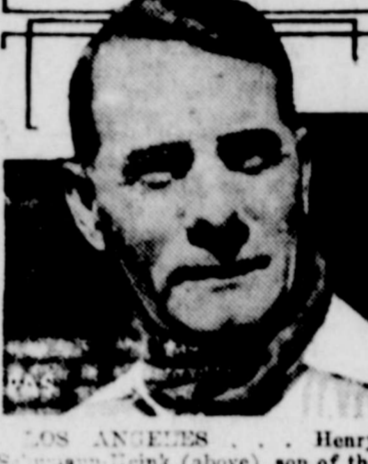
Not Afraid of Work