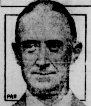
White House Chief