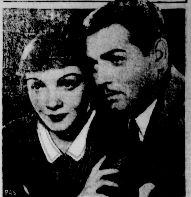
Acclaimed for Best 1934 Screen Performance

HOLLYWOOD . . . Above are Claudette Colbert and Clark Gable who co-starred in "It Happened One Night" to win the award of the Academy of Motion Picture Arts, as the best screen performance of 1934. The awards were gold statuettes.