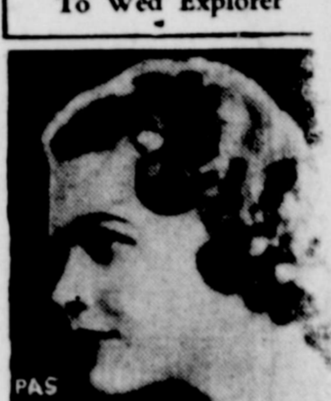
To Wed Explorer