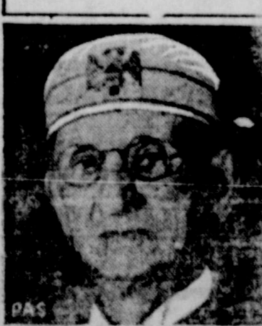
Oldest N. Y. Mason