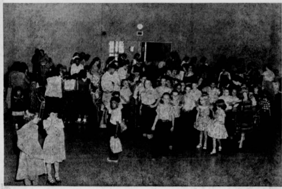
THEIR FIRST REGISTRATION leaves these first-graders just a bit bewildered. Many mothers and teachers were present, however, to help them with their enrollment problems. This procedure will become commonplace to the young scholars during the next twelve to twenty years.